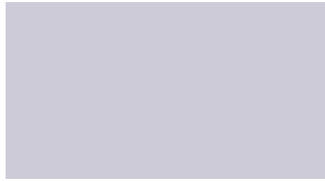
Reflective White (RF)