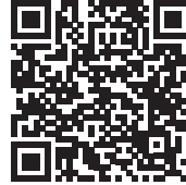
Cool Coatings Spec Sheet

Scan codes below for the most current Cool (reflective) Roof ratings.*