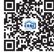
Cool Roof Rating Council Directory