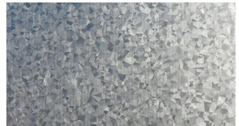
Galvalume ★ (GM)

★ Non-PVDF. The Galvalume coating process is likely to result in variances in spangle (size, number, and reflection) from coil to coil which may result in noticeable shade variations. Galvalume is also subject to variable weathering and may appear to have different shades due to weathering characteristics. These shade variations are not cause for rejection. The term “TBK” on the Order Document refers to “To Be Selected” from standard PVDF colors as shown on this chart. Please note that PVDF is a slight upcharge over SP.