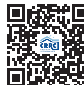
Cool Roof Rating Council Directory