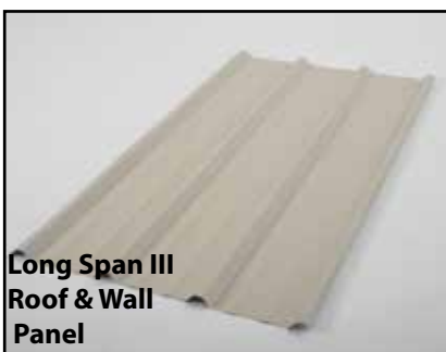
Long Span III Roof & Wall Panel