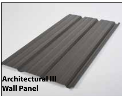
Architectural III Wall Panel