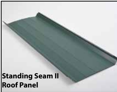
Standing Seam II Roof Panel

American Buildings Company has established this hotline as a resource to connect local businesses with contractors to rebuild and repair after Hurricane Michael.