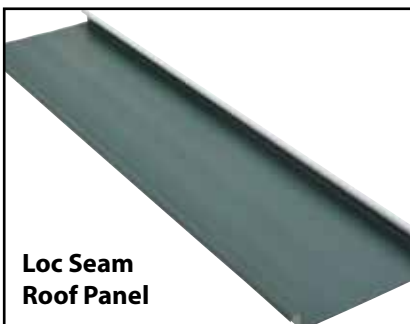
Loc Seam Roof Panel

When you call, an ABC representative will assist you in getting in touch with a local contractor. ABC's expert roofing unit will also be available to assist with your roofing needs.