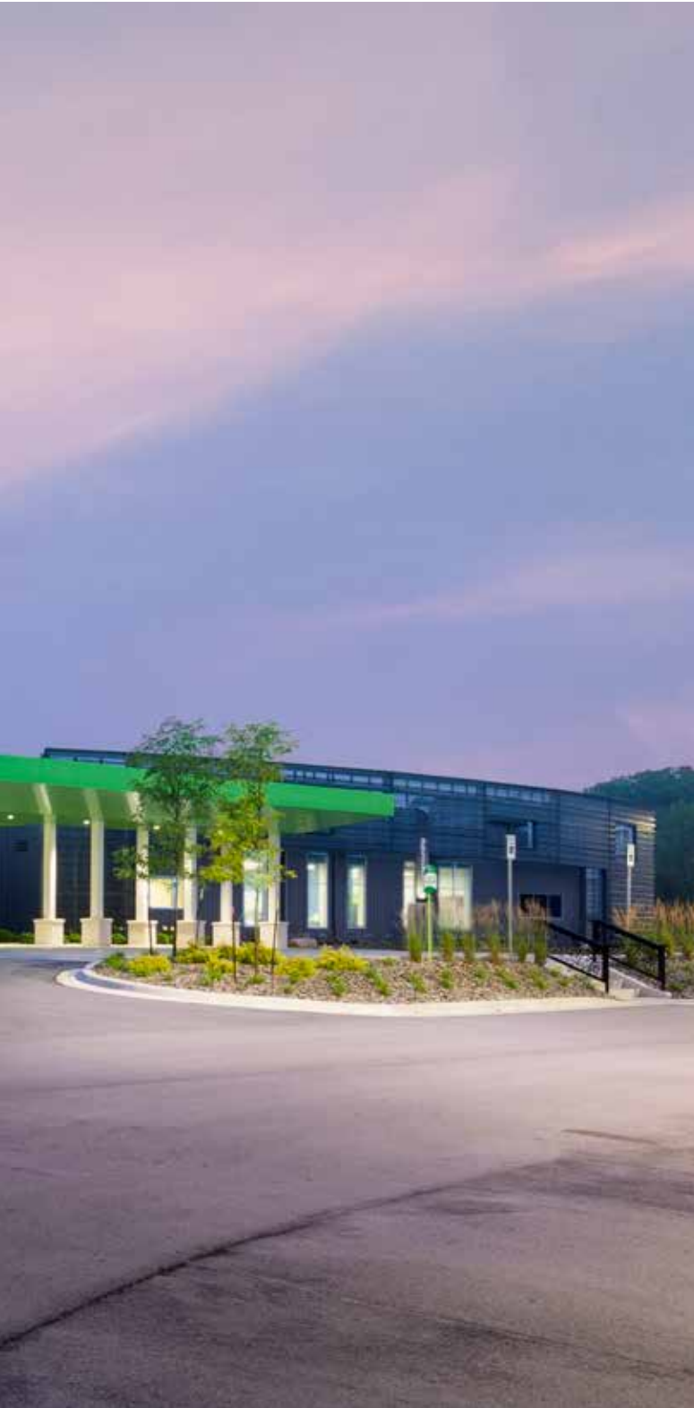
1 Junior Achievement of Northern Indiana Fort Wayne, IN

BUILDER: The Hagerman Group GC: The Hagerman Group ARCHITECT: Design Collaborative