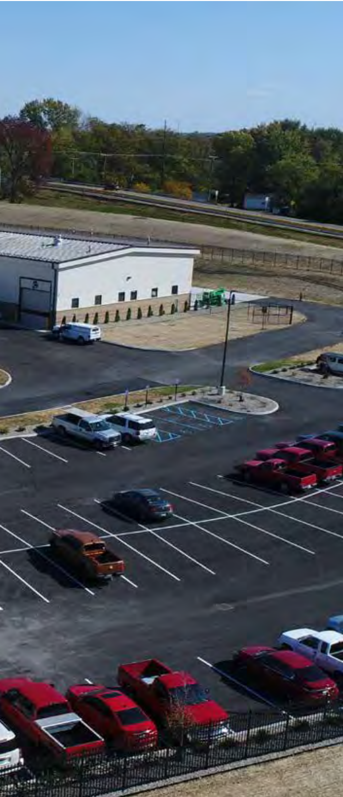
1 City of Greenwood Public Works Maintenance Facility Greenwood, IN BUILDER: Myers Construction Management, Inc. GC: Myers Construction Management, Inc. ERECTOR: Wolf Builders ARCHITECT: DLZ