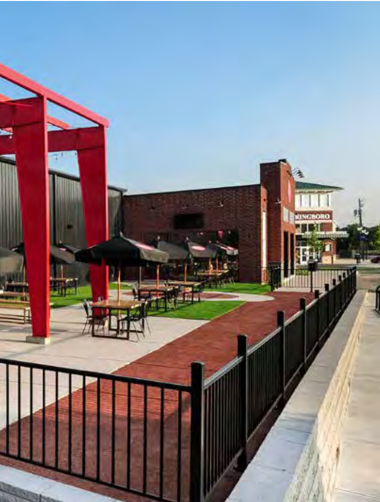
1 Warped Wing Brewing Co. Springboro, OH BUILDER: Kingsolver Construction GC: Synergy Building Systems ERECTOR: Kingsolver Construction ARCHITECT: Moda4 Design