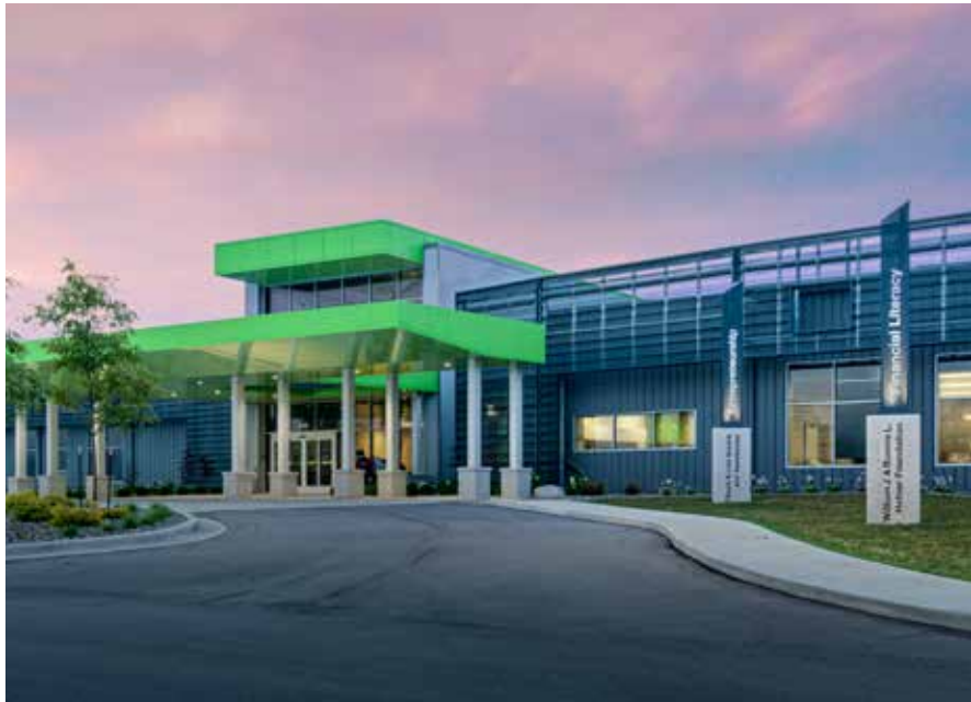
ABC'S EXCELLENCE IN DESIGN BUILDING OF THE YEAR: Junior Achievement of Northern Indiana