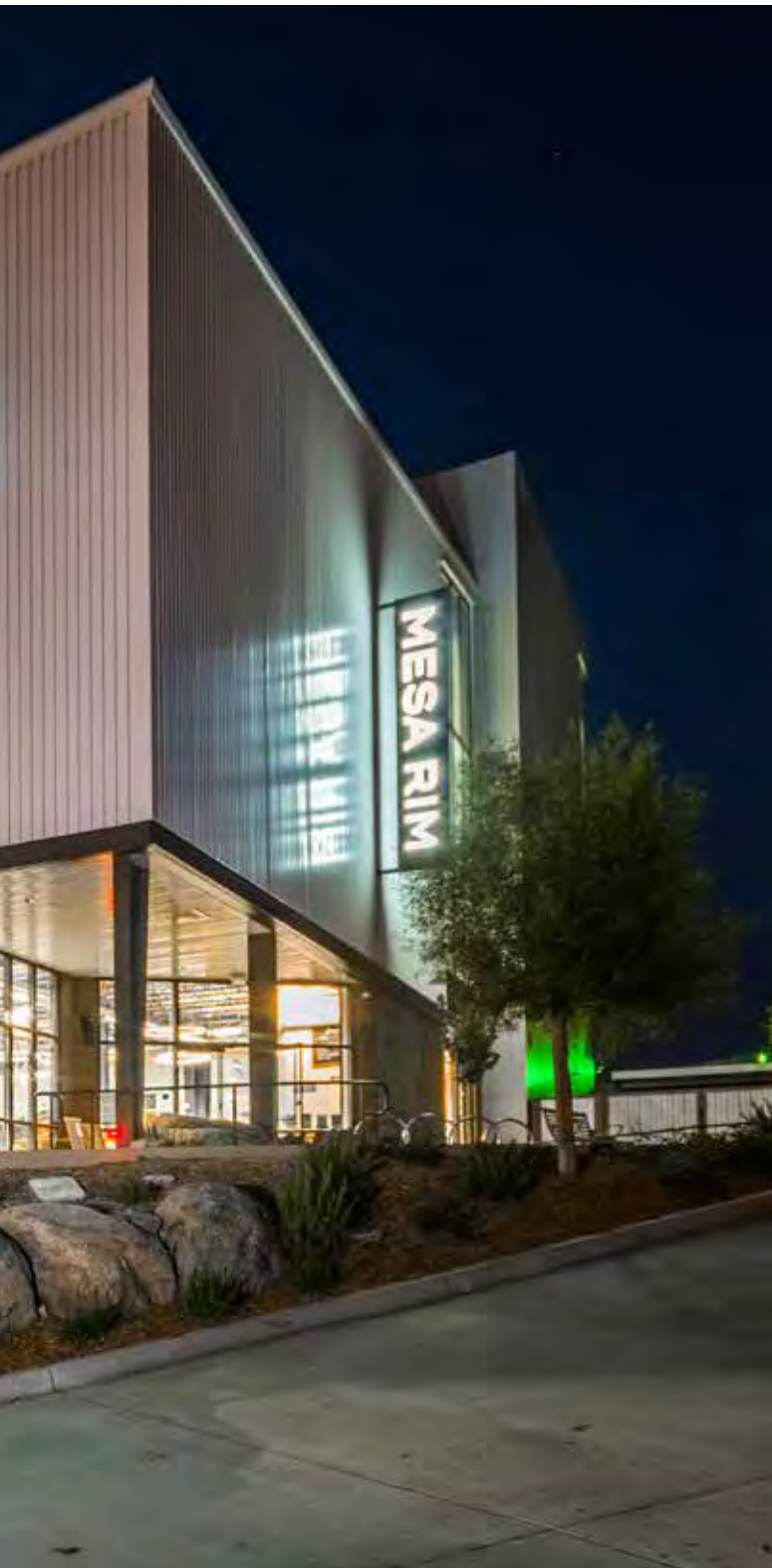
1 Mesa Rim San Marcos, CA

BUILDER: G&W Builders Inc. GC: Richard and Richard Construction ERECTOR: G&W Builders Inc. ARCHITECT: Richard and Richard Construction